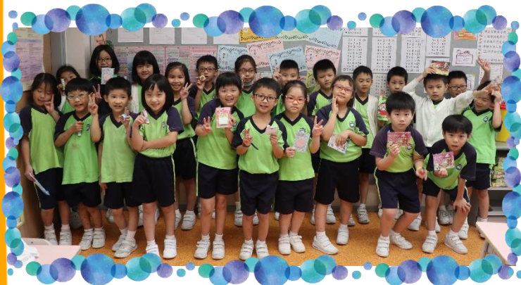
Students from Class 2E showing their prizes

Primary 1 and 2 students have been working hard all year in their PLP-R/W lessons. At the end of every lesson, the winning team was rewarded with stars. At the end of the school year, the lucky Superstars won animal toys. All the other students got prizes too. Congratulations to the winners!